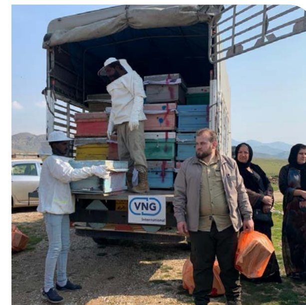
Beekeepers with honeyboxes in Sheikhhan district.