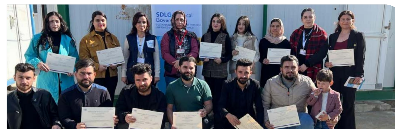
IDP graduates show their certificate upon finalising a course in general computer skills, Microsoft Office applications and guidance on how to search and apply for jobs.

In November 2024, 14 Iraqi stakeholders joined a study visit to the Netherlands , exchanging knowledge on water governance, intergovernmental cooperation, leadership, citizen engagement, LED, waste management, and tourism.